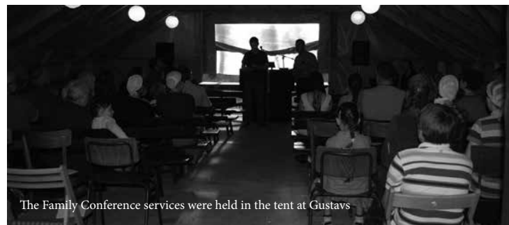
The Family Conference services were held in the tent at Gustavs