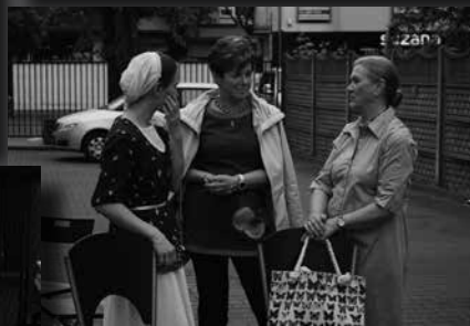
Some of our great students at the GTE party