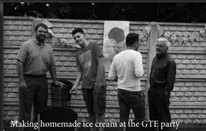
Making homemade ice cream at the GTE party