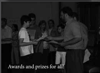
Awards and prizes for all!