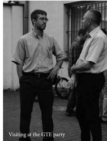
Visiting at the GTE party