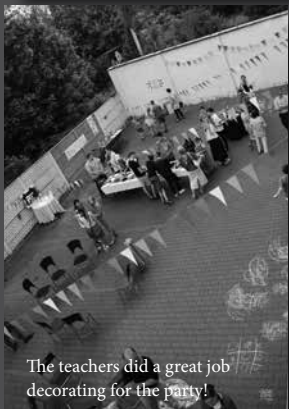
The teachers did a great job decorating for the party!