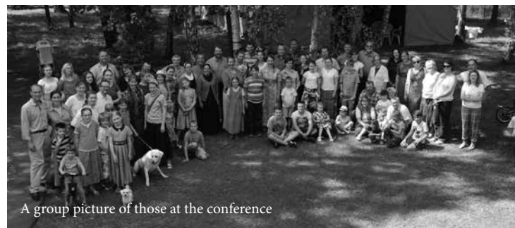
A group picture of those at the conference